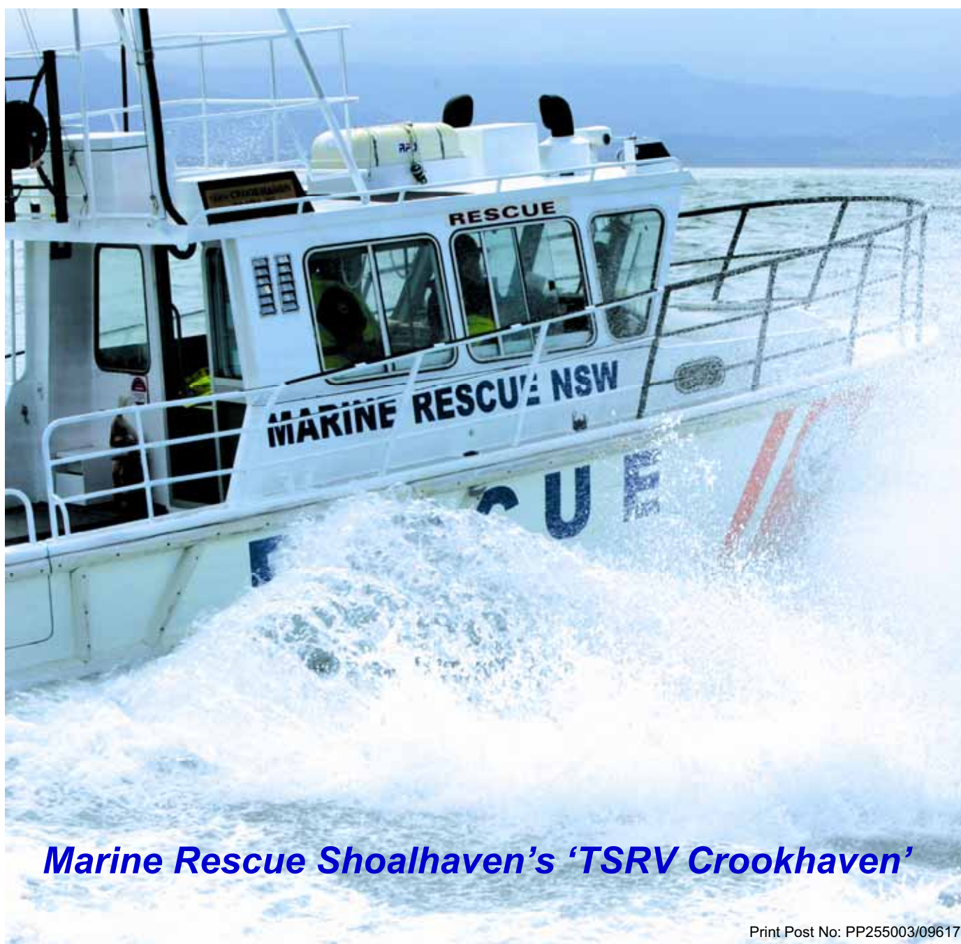
Marine Rescue Shoalhaven's 'TSRV Crookhaven'

MR Safety-net around the Hawkesbury Canoe Classic...38