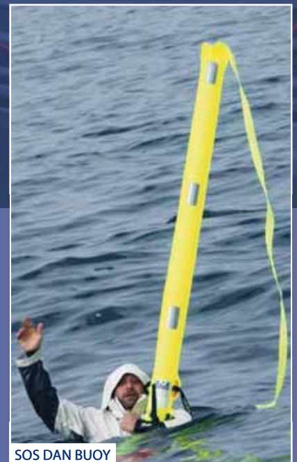
SOS DAN BUOY