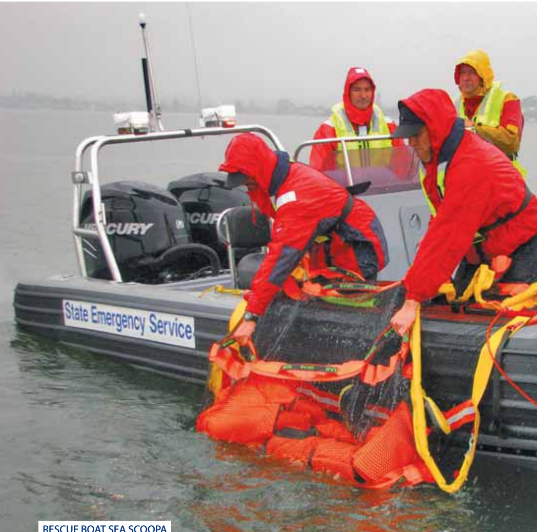
RESCUE BOAT SEA SCOOPA